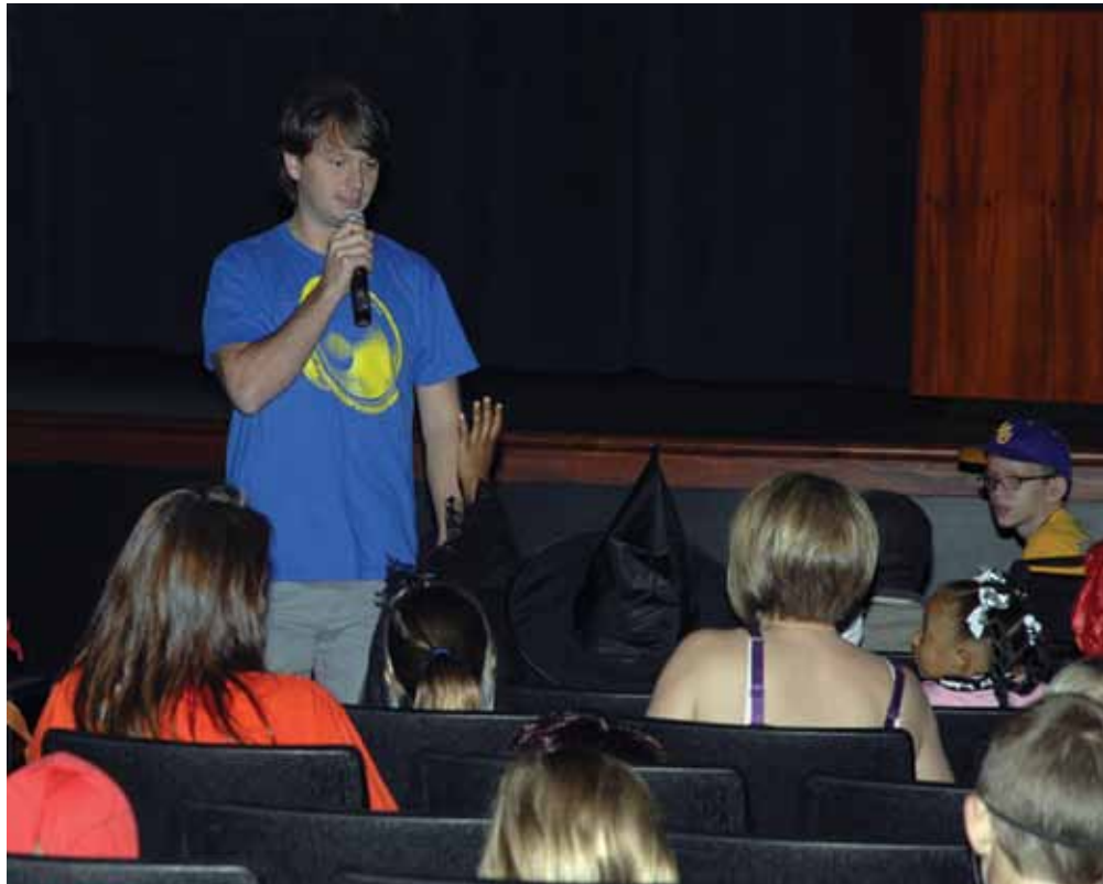
Shock from The Electric Company paid a special visit to Baton Rouge on October 31.

The national Raising Readers project is funded by U.S. Department of Education's Ready to Learn grant with support from the Corporation for Public Broadcasting, PBS, and the Ready to Learn Partnership.