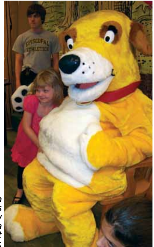
Martha from Martha Speaks made new friends at a special event in October.

kindergarteners, and the Electric Company Afterschool Program which uses the program to improve the literacy skills of elementary students and the Library.